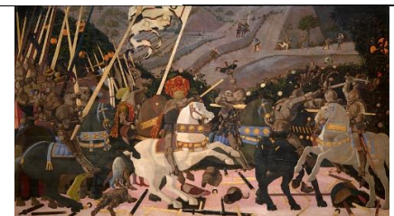
The Battle of San Romano (one of three panels). Painted in the mid-1450's. Commemorated the victory of the Florentine army in 1432. Held at the National Gallery, London.