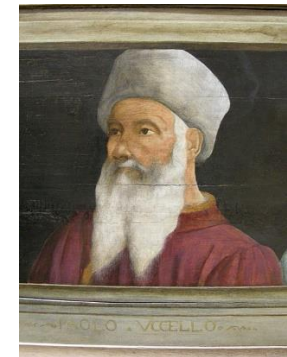
Portrait of Paolo Uccello by an unknown artist. Held at The Louvre, Paris.